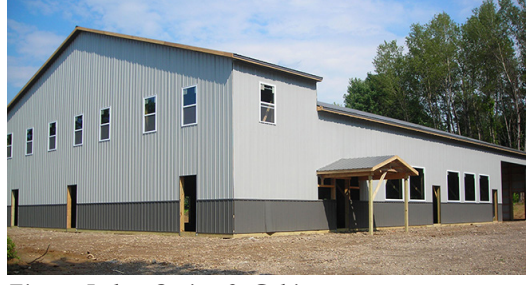
Finger Lakes Stairs & Cabinets